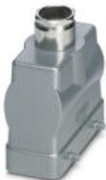
HEAVYCON B16 sleeve housing, for double locking latch, height: 76 mm, with 1 x Pg21 screw connection, straight cable outlet

Please be informed that the data shown in this PDF Document is generated from our Online Catalog. Please find the complete data in the user's documentation. Our General Terms of Use for Downloads are valid ( http://phoenixcontact.com/download )